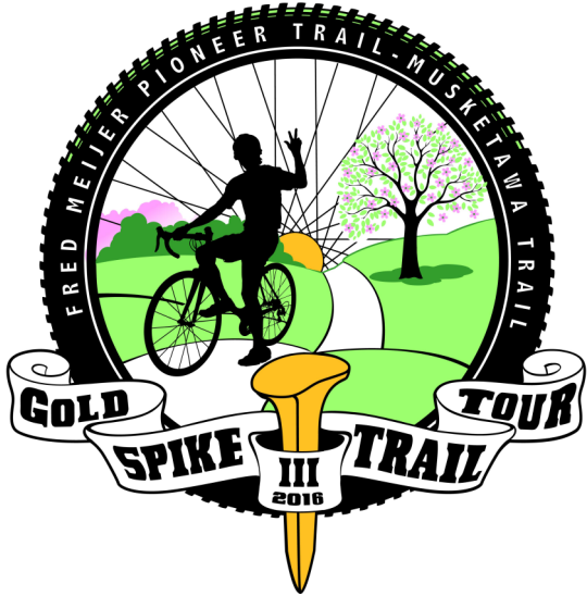
Gold Spike Trail Tour III Musketawa Trail Map May 28, 2016