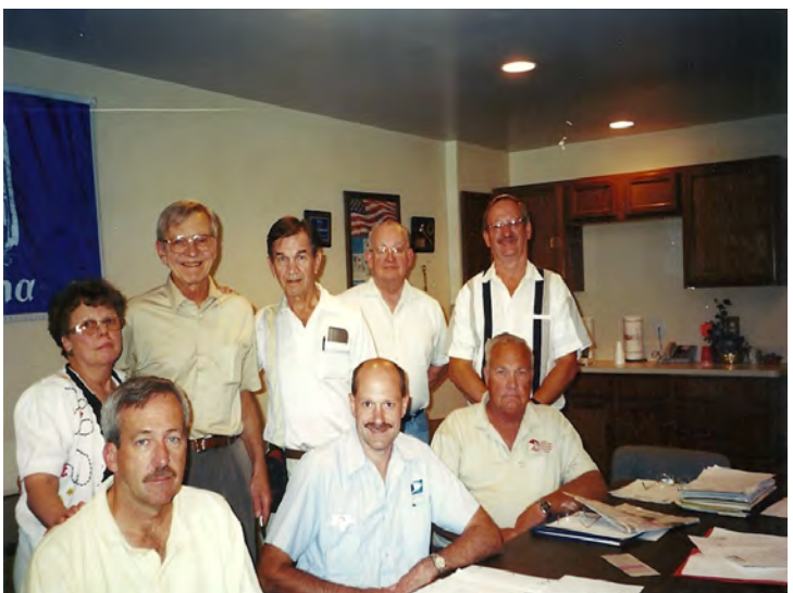
Our first Board of Directors and our current Board of Directors