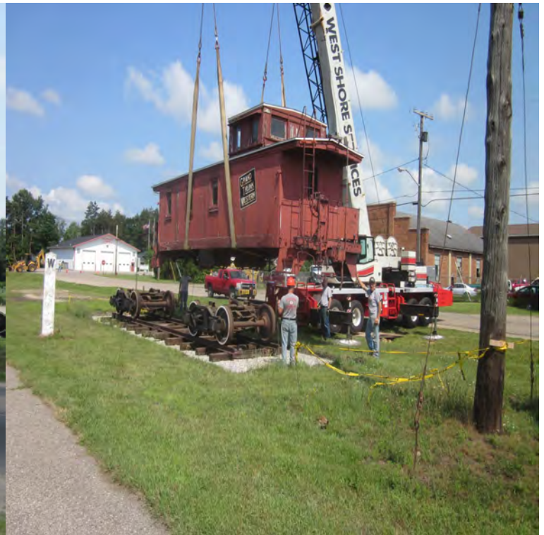
Once in a lifetime viewing installation of a caboose , July 2015, at the Ravenna Trailhead