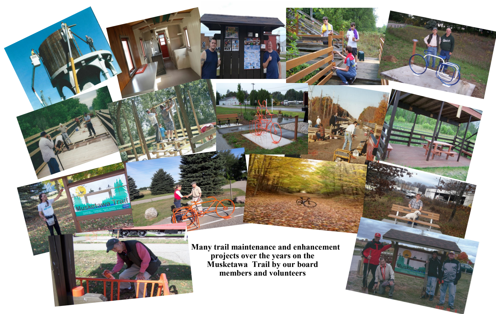
Many trail maintenance and enhancement projects over the years on the Musketawa Trail by our board members and volunteers