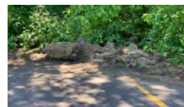
Old dried grass clippings

NEW TRAIL SIGNAGE ON THE TRAIL: "Keep an eye out for new signage going up along the Musketawa Trail. The Michigan DNR approved the addition of some updating signs. We will have some "Welcome to" signs added that visually show what forms of usages are allowed on the trail. "No Wheeled Motorized Vehicles" signs are being added. Also, at each of the trail heads, a courtesy sign will be added to address when it is proper to use snowmobiles on the trail (when there is 4+ inches of snow). Additionally, to remind users that dumping of any kind including grass clippings is not allowed at our trail heads or along the trail. The Muskegon/Broadway trail head will be getting "No Dumping" signs. Look for these signs to be installed in the Fall 2019 / Spring 2020 timeframe."