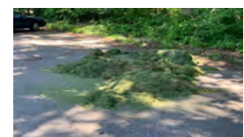
Fresh grass clippings