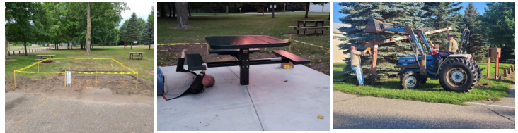
Examples of trail maintenance & enhancement projects

Your donations provide us with the means to continue our trail enhancements, promotions, and maintenance projects so you can enjoy a safe ride.