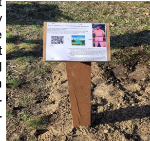
E. Holovka memorial post marker

Please note that your donation is for the "Ed Holovka Memorial" in the comments or on the check. If anyone is curious as to the location of this project, there is a 4 x 4 post in the ground next to the trail at the Broadway trail head. The location is just after the trail access path meets the normal trail surface.