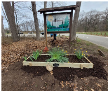
Completed flower box with freshly planted flowers

head. They also planted flowers in the newly rebuilt flower box at the parking lot entrance. The Michigan DNR will come out to remove the trash and also to