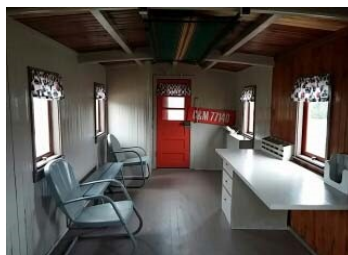
Caboose interior, come see for yourself

Attendees will get a chance to go inside the caboose and the replica depot building next to the Ravenna trail head. The first planned Open House is set for Saturday, June 3, 2023. We will also have dates of July 8 and August 5.