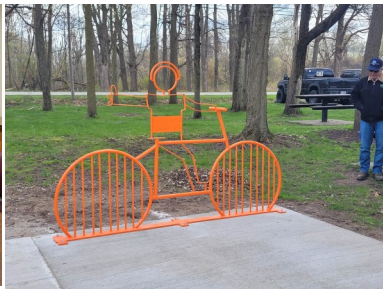
Sharon Davis Memorial Bicycle rack