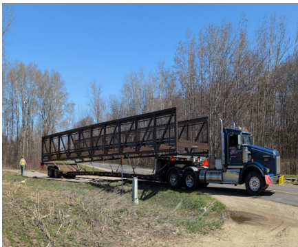
Rio Grande Creek Bridge being delivered to the site.

“Trail reconstruction work continued through the winter with a 6-week pause due to weather conditions. Work has been continuing as spring has finally arrived! All the culvert installations have been completed along with the railing installations. The Rio Grande Creek bridge was installed on April 10. They will now be working on pouring the concrete deck and installing the protective epoxy coating on the concrete.