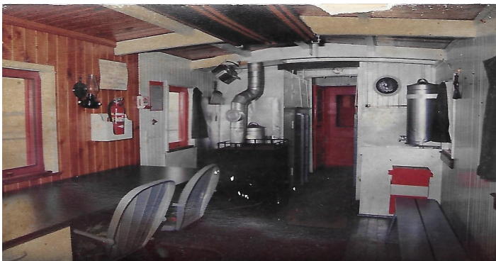
Caboose back in the day