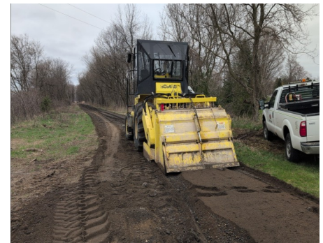
Pulverizing of existing trail preparing for new pavement

new asphalt surfacing later this spring. We will also be replacing the surface at the Marne Trailhead parking lot since it was used as a construction staging area. New signage will be installed along the trail as well. We anticipate that this work will be completed by late summer. We are continuing to evaluate potentially opening a portion of trail for public use later this summer. The Crockery Creek Bridge area will remain closed until work is complete. Jill Sell