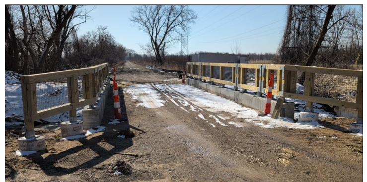
Complete culvert and handrail