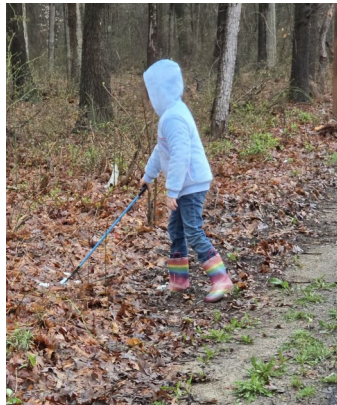
This year we had a young volunteer helping out along with the cleanup crew. They filled a few garbage bags and enjoyed some snacks.

We look forward to this work being completed and sharing the renewed portion of the trail. We might even have a “pop-up” ride event when the current re-construction work is completed. Stay tuned and please enjoy photos of the work!