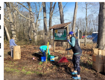
Broadway cleanup & flower planting

While on the topic of the Muskegon/Broadway trail head, we wanted to mention that we will be planning another “Clean-Up” day at said parking lot. This will be a Sat-