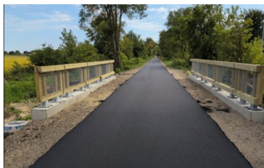
Paved trail over a new box culvert, handrail installation in progress

Engineering, permitting, and acquiring funding are being worked on for Phase 2 of the project. Phase 2 will include the remaining trail work within Muskegon County that will not be completed during the current construction work.