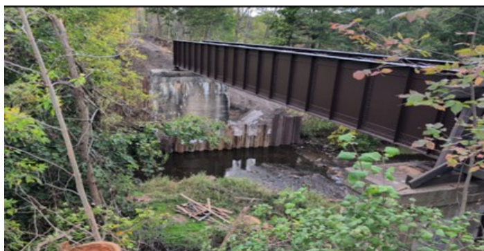
Crockery Creek Bridge steel mid-span. Freshly painted and sealed. New deck and railings will be installed after repairs are complete. New, pre-fabricated bridges will be installed at both ends to complete the span over Crockery Creek.

Tim Nink, President Friends of the Musketawa Trail