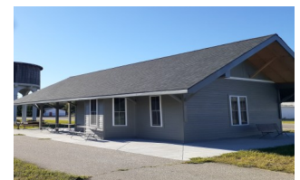
The Depot at Ravenna Trailhead