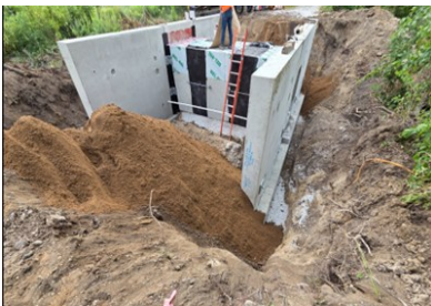
Installation of a box culvert in progress