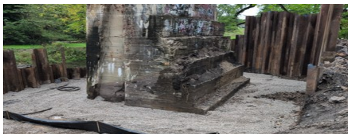
One of the Crockery Creek Bridge piers is prepped for repair work.