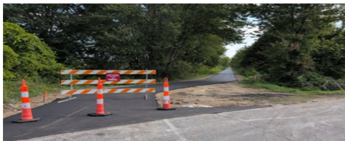
Paved section of trail